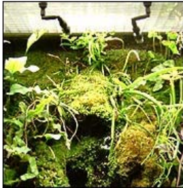
Lamp for plants in vivarium

Light is the most important factor for plants to grow and flower in the vivarium. Plants cannot grow when they receive a light-intensity of less than 1000 lux.